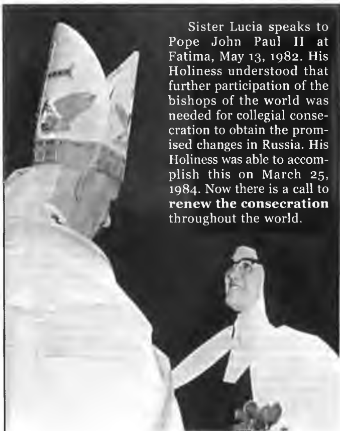
Sister Lucia speaks to Pope John Paul II at Fatima, May 13, 1982. His Holiness understood that further participation of the bishops of the world was needed for collegial consecration to obtain the promised changes in Russia. His Holiness was able to accomplish this on March 25, 1984. Now there is a call to renew the consecration throughout the world.

The commands of the vicars of Christ for annual renewal of consecration to Their Sacred Hearts have been largely ignored. Perhaps this is one of the reasons the Fatima week advances so slowly.