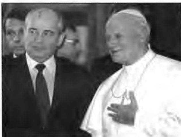
Pope John Paul II speaking with Gorbachev, the Soviet leader largely instrumental in the change in Russia.

And who prevented it? Who brought us to the moment of mercy, the moment when the Holy Father and all the