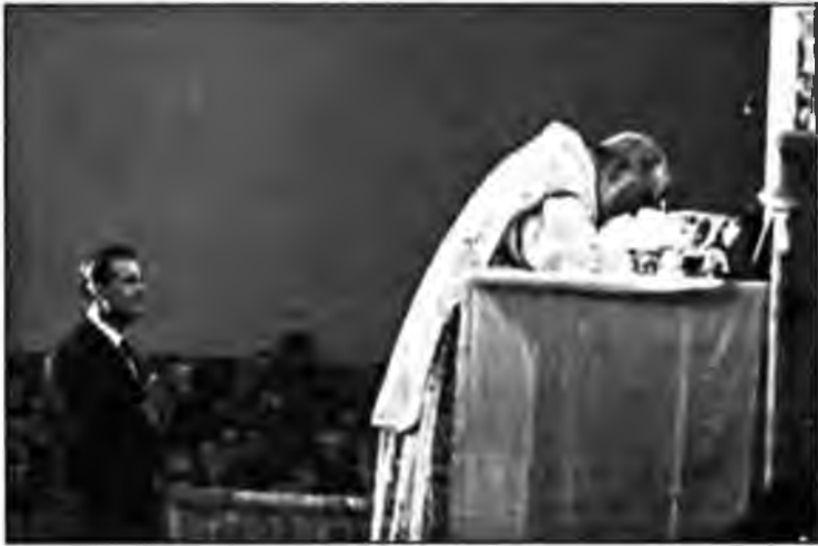
Bl. Padre Pio, when asked if it was a good thing to join the Blue Army, answered: “ Could you do anything better? ” Above: The author serving Bl. Padre Pio’s Mass.

“It is into this battle that Our Lady comes, having appeared at Fatima to bring us Her message from Heaven, to place in our hands the arms of victory.”