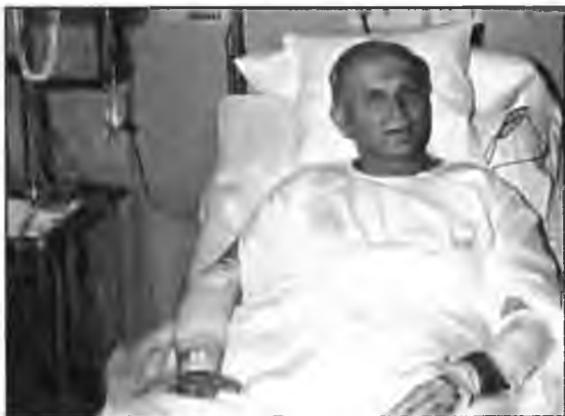
Pope John Paul II in Gemelli Hospital in Rome. During his three months of recovery, he studied the documents of Fatima.

Finally realizing the urgency and importance of the Fatima message, he decided to send letters of instruction,