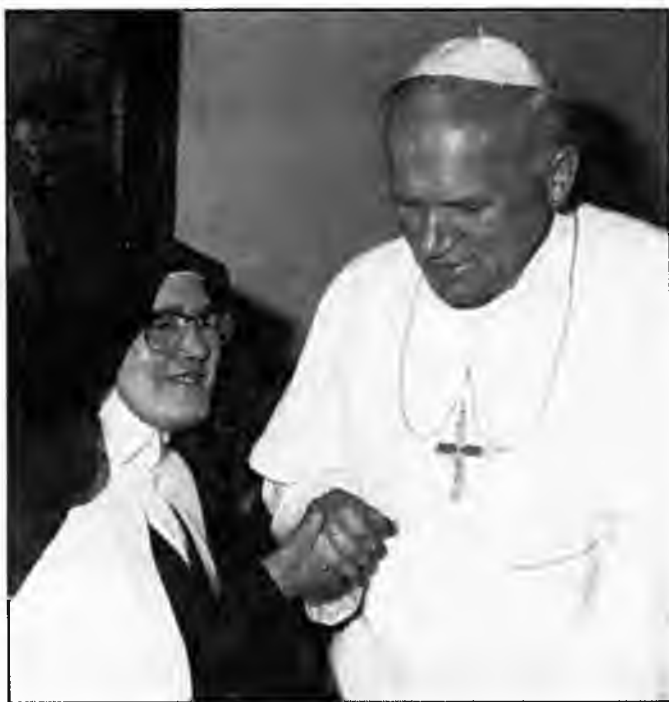
The Holy Father speaks with Sister Lucia at Fatima in 1982. His Holiness had come to thank Our Lady for his recovery from attempted assassination the previous May 13.

In "the Fatima week," after narrowly escaping death on May 13, 1981, Pope John Paul II saw himself as chosen: "Perhaps this is why the Pope was called from a faraway country, perhaps this is why it was necessary for the assassination attempt to be made in St. Peter's Square precisely on May 13, 1981, the anniversary of the first apparition of Fatima...so that the voice of God...could more easily be heard and understood."