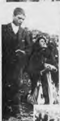
Formosa multidão de peregrinos em Fátima, Portugal, durante as aparições de 1917.